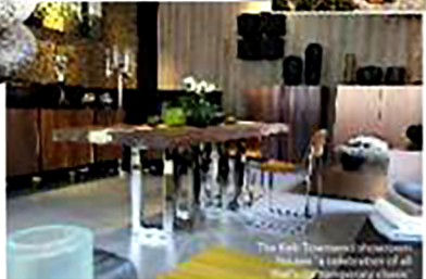
The Keir Townsend showroom is a celebration of all things 'contemporary classic'