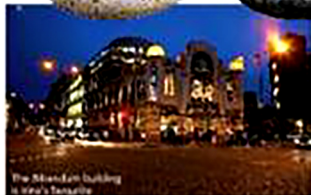
The Alhambra building in Granada, Spain