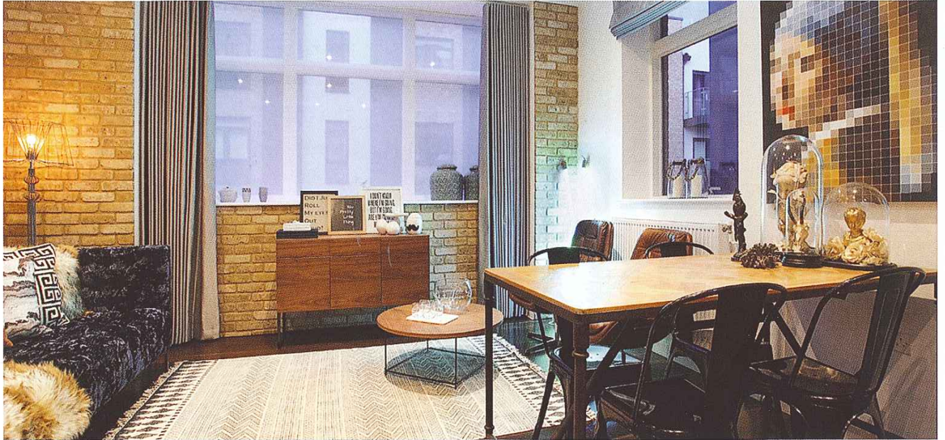
The Joinery Living Room for Family Mosaic by Suna Interior Design

WHAT ARE THE MOST POPULAR REQUESTS FROM CLIENTS WHEN CREATING DINING AND LIVING SPACES?