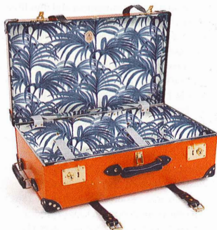
■ Pack up your troubles and prepare for the perfect escape Palmeral Globe-Trotter 28" Wheeled Suitcase , £1,255 ( houseofhackney.com )