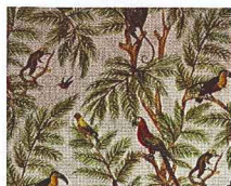
Miki Rose Jungle Print Wallpaper £125 ( graduatecollection.co.uk )