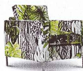
Metro Chair £1,161 ( delcor.co.uk )