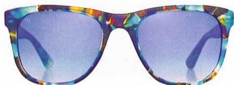
■ Forget rose-tinted spectacles, life looks infinitely better through sea blue lenses Saratoga II , £150 ( taylormorrisseyewear.com )