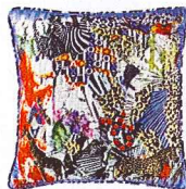
Christian Lacroix Glam'Azonía Citrus Cushion £115 ( designersguild.com )