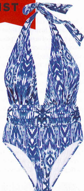
■ Make a lido dip feel positively Caribbean Little Dix Bay Ruched Belt One Piece , £195 ( heidiklein.com )

We're diving into summer with blue beauties guaranteed to take us to the beach mentally, if not physically