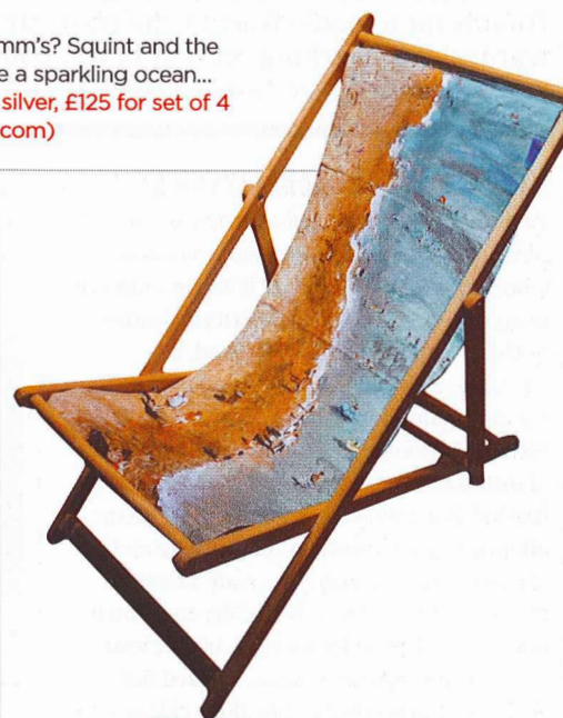
■ Lie back and think of, well, anywhere but England, really Life's A Beach Deckchair By Jacqueline Hammond , £100 ( notonthehighstreet.com )