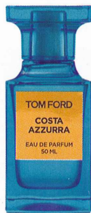
■ Evocatively salty, Sardinian memories are made of this Tom Ford Costa Azzurra (EDP, 50ml), £142 ( harrods.com )